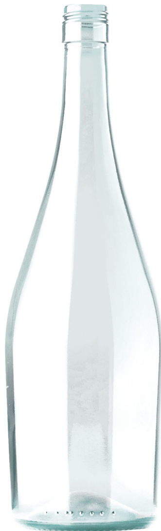
HALF FLINT F2008219