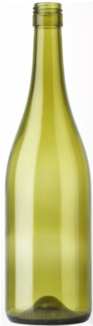
DEAD LEAF LI100927