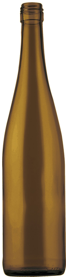
ANTIQUE GREEN T1120082