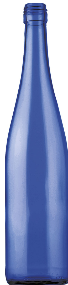
LUXURY ROYAL BLUE S0120082