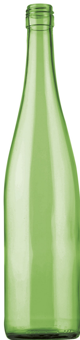
GREEN BEER EMERALD G3120082