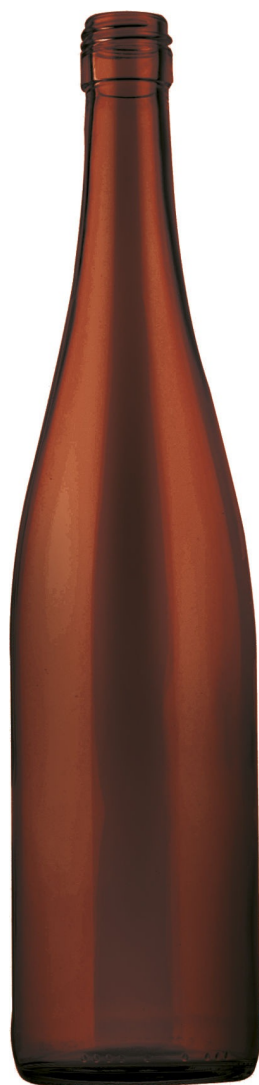
AMBER DARK A2120082